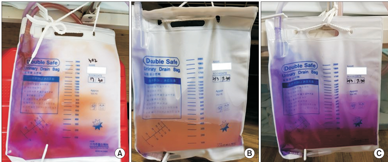
Fig. 1. Purple color of the urine bag and tube. (A) Purple-colored urine in case 1. (B) In case 2, about 5 days later after changing the catheter. (C) In case 2, darker purple over time.

PUBS lasted 5 more months and then resolved. The only condition that changed was that the patient's bean curd intake decreased.