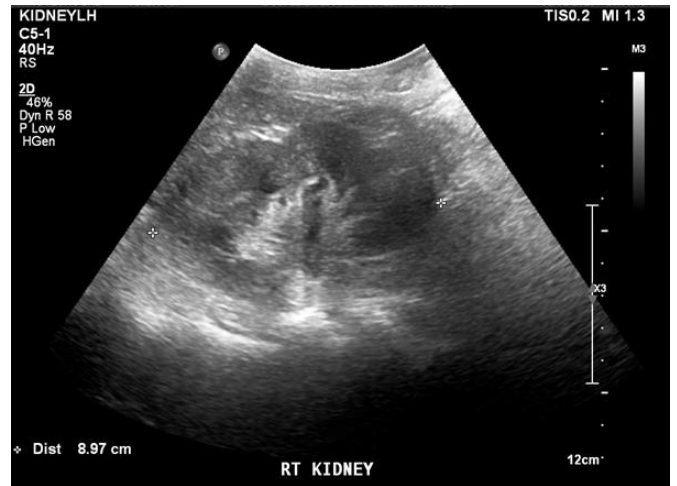
Fig. 2. Kidney ultrasound demonstrating a longitudinal view of normal-sized kidneys and a shape with the resolution of hydronephrosis in the right kidney.

Fecal impaction can be caused by GI tract damage owing to Hirschsprung disease, prior intestinal surgeries, and anorectal malformations. 3-5) However, chronic constipation is also a common cause of fecal impaction, especially in older adults. 6) A fecaloma is a mass of inspissated